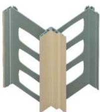
3 pc Corner (inside assembled)

The 3-piece corner makes installing a corner simple. It allows for easy fitment and access to all rebars. The design was created to resolve installer and inspector's worst nightmare