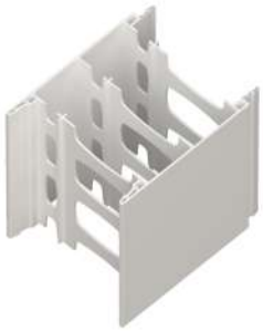
8" Form (8" Concrete)