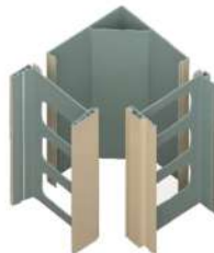
3 pc Corner (apart)