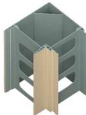
3 pc Corner (assembled)